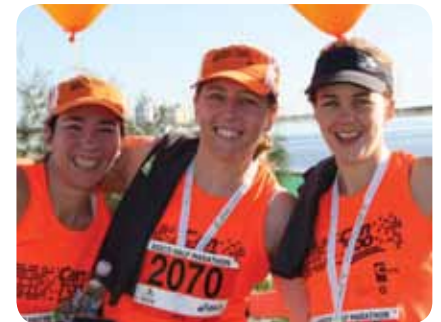
Can Too hits Brisbane in 2010

Yes Can Too moved north this year. How wonderful it was to have our first Can Too team in Brisbane training for the Gold Coast Half Marathon and 10k events. The specialness of our Can Tooers was repeated in the north and our team was spectacular. How thrilled I was to be part of this special day – running with our team as they achieved their dreams. Bring on 2011!!!