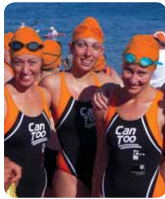
Can Too hits the beach for summer