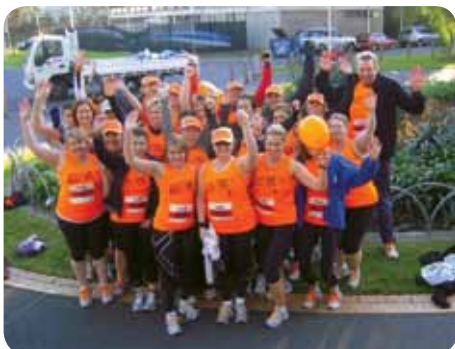
Can Too Melbourne continues to grow

A spectacular day was had by all 310 of our champion half marathoners on May 21st. The blood, sweat and tears that raised over $450,000 was as spectacular as the deafening cheers of our Can Too supporters that lined the course on race day. Thank you runners and cheerers alike.