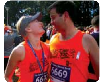
Can Too celebrates marriages, babies and great media exposure