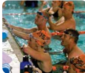
Can Too swim launches in Melbourne and expands in Sydney

For the first time ever Can Too will train Sydney siders to run the Marathon in the Gold Coast. This exciting new program will begin the first week of Feb in the Eastern Suburbs. Sign up now to run the flattest marathon in Australia on July 5, 2011.