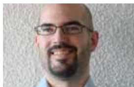
Dr Luc Furic SUPPORTED BY CAN TOO TARGETING TREATMENTS FOR PROSTATE CANCER