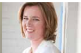
Dr Vibeke Catts SUPPORTED BY TEAM RACE FOR A CURE 2010 ANTI CANCER EFFECTS OF CHOLESTEROL TRAFFICKING AND SYNTHESIS INHIBITORS IN GLIOBLASTOMA